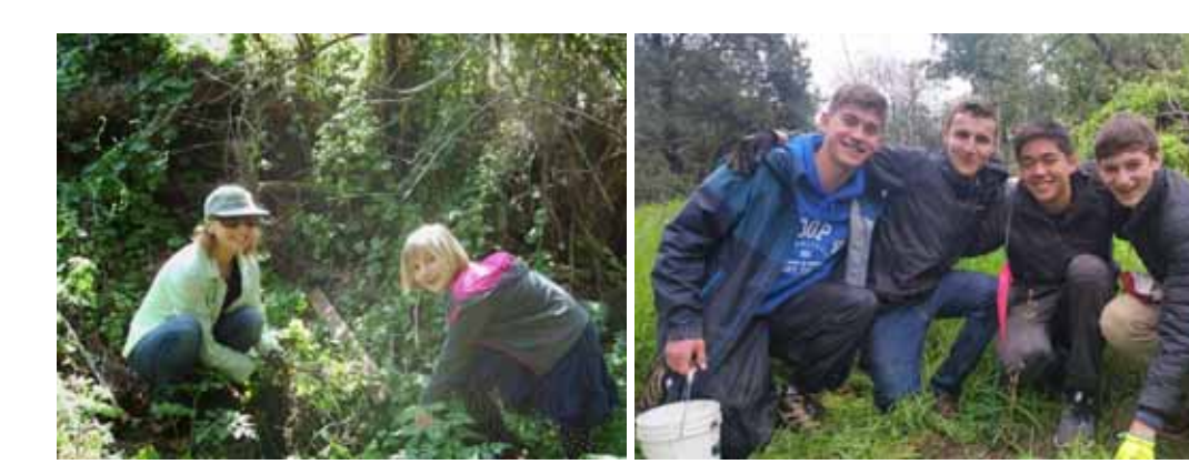
The Alameda Creek Alliance hosts habitat stewardship workdays for volunteers on the 3<sup>rd</sup> Saturday of each month this winter and spring. You can find more information about each event and register on ACA's Eventbrite page.

Upcoming ACA stewardship workdays include: